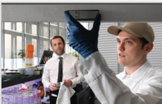
CAFÉS, RESTAURANTS & BARS