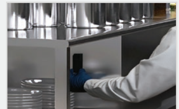
FOOD SERVICE KITCHENS