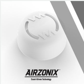
See options on VM Website