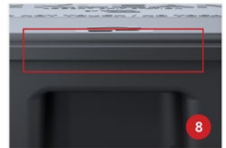
8 Raised lip around the front of the station deters unwanted entry.