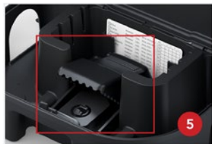
5 Accommodates the AP&G Catchmaster 621 snap trap.