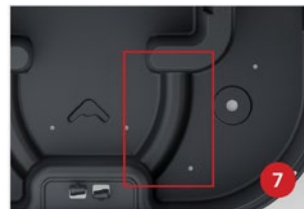
7 Internal half-moon-shaped walls give high-level durability to the station and keep water out.