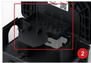
2 Comes standard with removable EZ Service Tray to make servicing quick and easy.