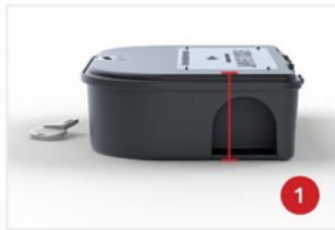
1 Low profile design.