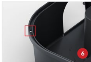
6 Drain holes throughout lid and base keep water draining out of station and away from bait.