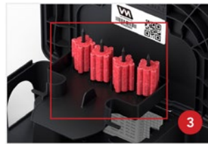
3 Accommodates four pieces of block bait.